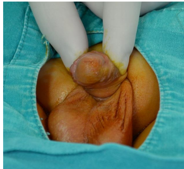
Fig. 1. Patient admitted with penile torsion complaint.

penile skin was undermined bilaterally to gain tension free closure of volar penile skin layer and sutured with interrupted 6-0 vicryles as previous layers. Total degloving and correction of the penile torsion was postponed to second stage due to wide urethral layer defect and necessity of urethral layer and skin connection for flip flap pedicle. No postoperative fistula seen after first surgery. After three months, patient admitted to our clinic to have a second surgery for the correction of the penile torsion (Fig. 1).