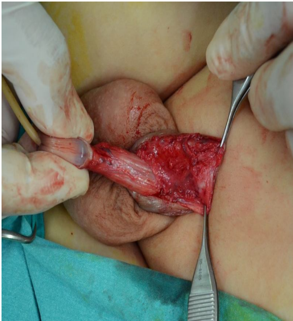
Figure 2. After degloving, fibrous tissues released to obtain proper alignment of the corpus.

catheterization. No obvious cordee was observed but 90 degree counterclockwise penile torsion was observed. In order to prevent possible iatrogenic fistula formation, hydro-dissection was performed in previous surgical sites and dissection was performed at the level of the Buck fascia. After total degloving, the pedicle of the previous preputial island flap and residual fibrous tissues were released to correct the penile torsion deformity and full correction established (Fig. 2).