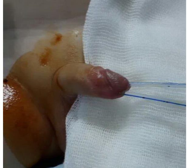
Fig. 2. Hypospadiac urethral duplication.

abnormalities and testes were bilaterally present in the scrotum. The patient's blood counts, blood chemistry, urine analysis, and urine culture were normal.