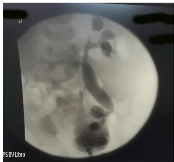
Fig. 3. Vesicoureteral reflux in voiding cystourethrography.

Examination of the urinary tract by ultrasonography revealed right renal agenesis and left Grade 2 hydronephrosis. The patient was then investigated by voiding cystourethrography and Grade 2 vesicoureteral reflux was determined (Fig. 3).