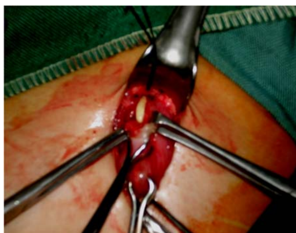
Fig. 3. Intraoperative finding with the distal end of VP-shunt inserted into the bladder dome.

Patient was started with appropriate intravenous antibiotics and underwent emergent procedure of extra peritoneal exploration with removal of VPS, and ventriculostomy tube insertion. Conduct of surgery began with simultaneously with the neurosurgery team. A 3 cm low transverse pfannenstiel incision was done and carried down to the extra vesical space. Intra-operative abdominal findings showed the VPS was seen within the peritoneum and has created a fibrous tract that transversed down toward the bladder. It was noted to penetrate the dome of the urinary bladder (Figure 3). The length of the VPS that entered the bladder was 8cm. The distal part of the VPS was encrusted with inspissated pus [Fig. 4] and was removed successfully with ease from the urinary bladder. The bladder was closed as two layers using a 4-0 polyglycolic suture in a continuous interlocking manner.