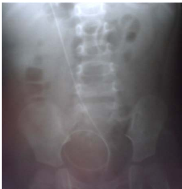
Fig. 1. X rays of the urinary tract showing VP shunt distal segment in the pelvic location.

confirming the presence of the tip of the VPS to be coiled inside the urinary bladder [Fig. 1, 2]. Urinalysis showed pyuria and bacteriuria. The urine culture taken on admission showed the presence of Klebsiella oxytica with a growth of 120,000 colony-forming unit (CFU).