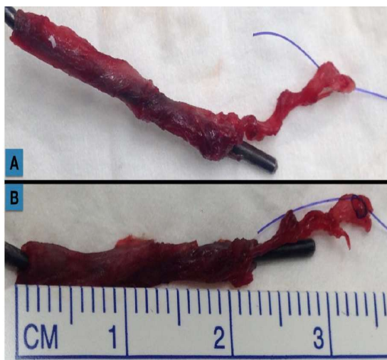
Fig. 2. After excision accessory urethra over a probe (A) and approximate length of the excised urethra was more than 2 cm. (B)