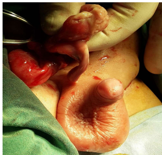
Fig. 2. Fibrin covered the caecum.

Ascending colon and terminal ileum were seen healthy in the hernia. Caecum and vermiform appendix occupied the hernial sac in the bottom of scrotum and were adherent to scrotum. The appendix showed suppurative inflammation [Fig. 2].