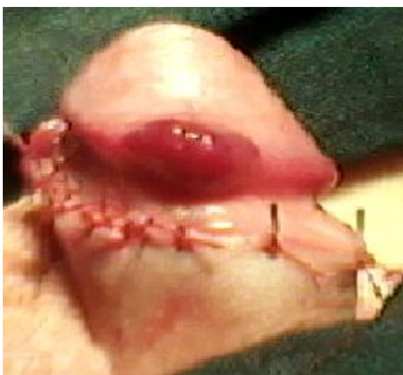
Fig.1. Hemangioma on glans of the penis

A 9 years old boy with red swelling on the left side of glans penis was admitted to our clinic with the desire of circumcision. His parents had noticed a bright red spot resembling a cherry on glans penis, but instead of regressing, it had gradually increased in size and volume since his babyhood. On physical examination, there was about 7 millimeters of hemangioma on glans penis that was discolored when pressed on (Fig.1). The lesion was totally excised during circumcision under general anesthesia. There was no abnormal scarring or disfigurement at the lesion site on follow up.