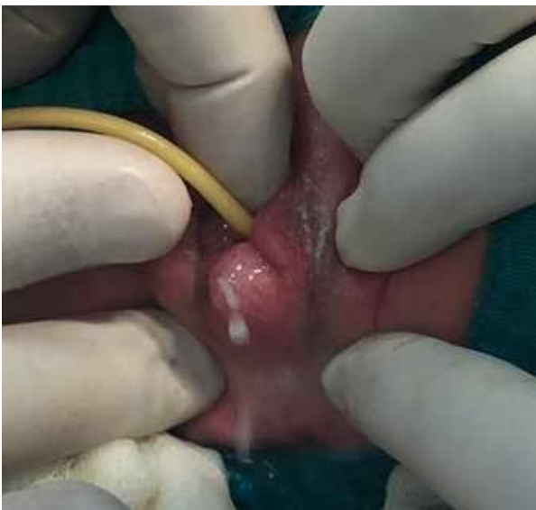
Fig. 2. Appearance of imperforate hymen and urethral foley catheter.

The hymenal orifice was then extended by excising some hymenal tissue (Fig. 4). A 10 French Foley catheter was placed in the vagina, and the balloon was inflated with 1 mL of sterile water to promote patency of the hymen. The balloon remained there for one week. The symptoms resolved, and the child was discharged. Subsequent control US imaging showed normal appearance of the uterus, vagina, and urinary tract.