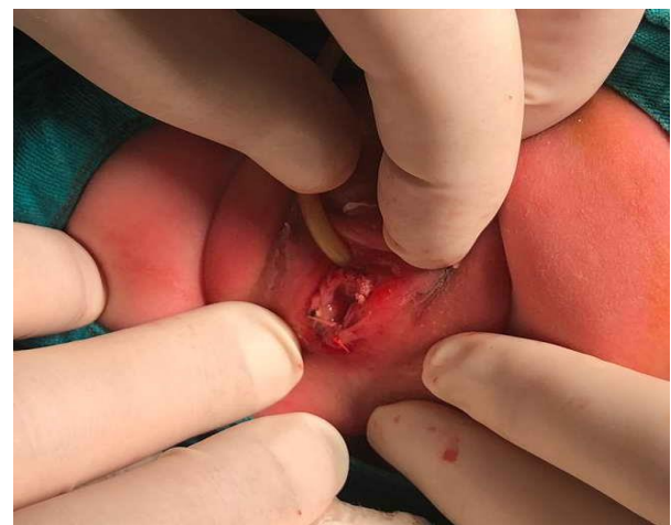
Fig. 4. After operation view of the vagina.