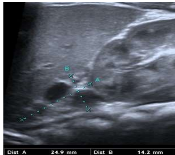
Fig. 1. Increase in the right adrenal gland size. Anechoic lesions are seen with diameters of 9 mm and 8 mm. The size of the adrenal gland 24.9x14.2 mm in diameter.

examination, anechoic cystic appearances were observed in the right adrenal gland. The patient was transferred to the neonatal intensive care unit of our hospital for the differentiation and clinical follow-up of adrenal carcinoma and NAH. After obtaining the patient's history presented above, an abdominal US examination was performed. There was an increase in the size of the adrenal gland and it measured 24x14 mm in diameter. (Fig. 1).