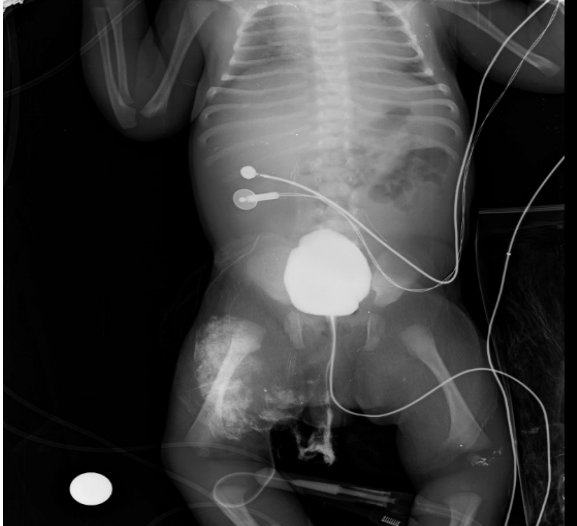
Fig. 1. Cystography shows no VUR or PUV like appearance.

After the improvement of the overall situation, because of bilateral renal pelvis diameter increased (R.35 mm and L.37 mm), and urine output decreased gradually, cystoscopy was performed to investigate PUV, and uretero-vesical junction (UVJ) obstruction and bilateral ureterocele with bladder trabeculations were detected in patient. Ureters could not be stented. Transcystoscopic incision of the ureterocele was carried out, but after operation, anuria developed, US revealed severe bilateral hydroureteronephrosis with 45 mm renal pelvis diameter, and emergent bilateral percutaneous nephrostomy catheter was inserted. The antegrad pyelographies were