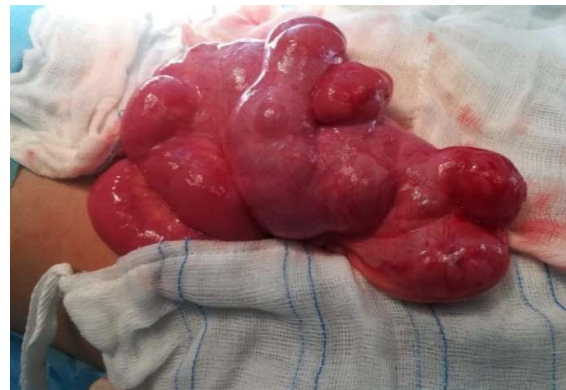
Fig. 1. Intraoperative photograph showing the ileal loops entrapped in a fibrous cocoon with scattered serial outpouchings.

At diagnostic laparoscopy there were multiple dense inter loop small bowel adhesions forming a fibrous cocoon leading to poor visualization and limited working space necessitating a conversion to a laparotomy. In addition to confirming the laparoscopy findings, the distal jejunal and ileal loops had multiple serosal out-pouchings (Fig. 1). There was minimal gelatinous free fluid with no peritoneal or omental deposits. The uterus, ovaries and tubes appeared normal. After complete adhesiolysis and release of the entrapped bowel from the cocoon, it was noted that there was no residual mechanical obstruction and enteric content could be milked freely into the colon. An incidentally noted Meckel's diverticulum was excised and the wall of the cocoon was sent for histopathological examination.