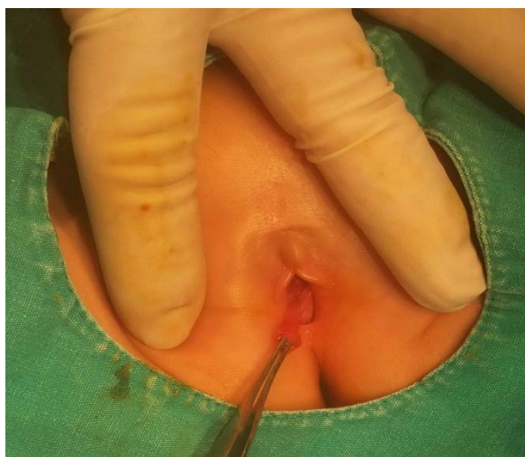
Fig. 1. A 1.2x0.5 cm polypoid mass, with a tall neck, originating from vaginal wall.

When the mass came out of the hymenal ring, physical examination revealed a 1.2x0.5 cm polypoid mass, with a tall neck, originating from superior vaginal wall [Fig. 1].