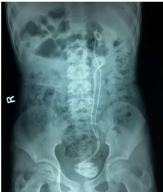
Fig. 1. Encrusted calculi on DJ stent ends.

Radiological investigations showed that not only were there retained DJ stents, but there were also encrusted calculi on their ends. An X-ray revealed the picture [Fig. 1].