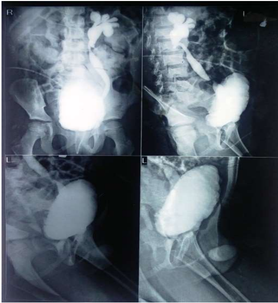
Fig. 1. Retrograde urethrograms and micturating cystourethrograms showing anterior urethral diverticula with the left sided vesicoureteral reflux (grade 3).

[Fig. 2A]. On incising the diverticula we found obstructing flap [Fig. 2B].