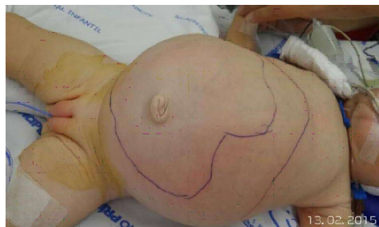
Fig. 1. Increased abdominal volume with extensive palpable mass.

defined limits, hardened, mobile, measuring approximately 10 cm and crossing abdominal midline [Fig. 1].