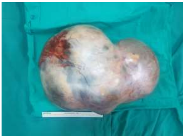
Fig. 2. A huge cyst in left ovary.