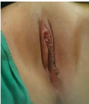
Fig. 2. Resection of the excess labial tissue using the simple edge excision technique.

Patients were placed under dorsal lithotomy under general anesthesia. Then, reduction labioplasty was done by simple edge excision technique using the cautery while preserving the labial contour. After adequate hemostasis, the wound was closed with 4-0 vicryl sutures in a simple interrupted fashion [Fig. 2].