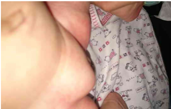
Fig. 1. The appearance of the right inguinal swelling.

40 days old female infant was referred to the pediatric clinic for right inguinal swelling [Fig. 1]. She was a term vaginally delivered baby who had 2700 gr weight, 50 cm height at birth. There was no significant perinatal problem. The family had first recognized the groin swelling two weeks ago. In physical examination there was an irreducible movable mass in her right groin that appeared larger while crying or straining. There was no history of illness, irritability, vomiting.