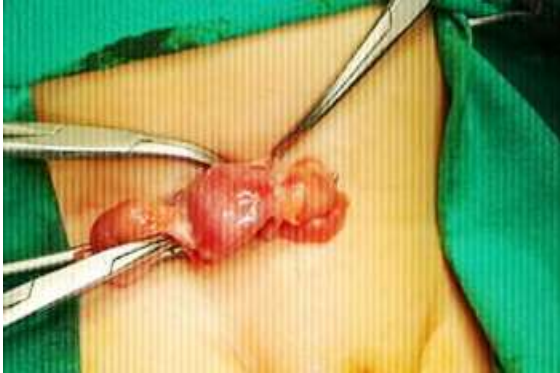
Fig. 3. Intraoperative findings. The hernia sac containing the uterus, fallopian tube, and both ovaries.

that elective surgery planned. A week later hernia occurred again and surgery confirmed the hernia sac containing the uterus, fallopian tube, and both ovaries [Fig. 3].