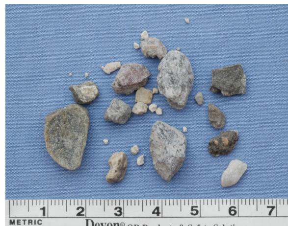
Fig. 1. Multiple stones passed spontaneously from vagina.

An 11-year-old girl was admitted with complaints about recurrent spontaneous passage of stone and abdominal pain for 4 months. She had a bottle within multiple stones the biggest of which was 1.5 cm diameter (Fig. 1). She had been investigated wholly in three centers and then the patient and her mother had not been