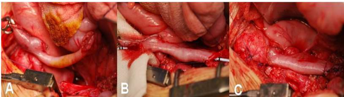
Fig. 1A-C. Appearance intraoperative of left total ureteral substitution with appendix.

At last follow-up (13 months after the surgery) we report only one urinary tract infection, a regular CIC, an improved US study (left pelvis dilatation of 15 mm), a normal renal function.