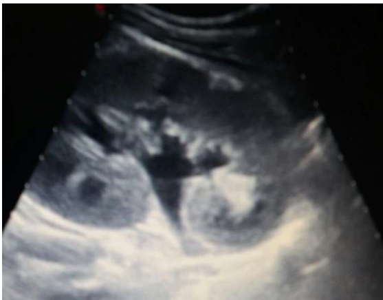
Fig. 3. At hospital discharge, normal ultrasonography imaging.