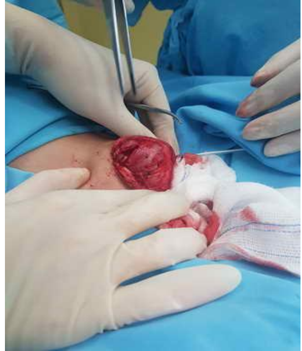
Fig. 3. Intraoperative view of the mass.

Incomplete surgical excisions were performed, macroscopically the sample was measured 3.2 cm x 4 cm x 3 cm and we also performed dorsal circumcision (Fig. 3).