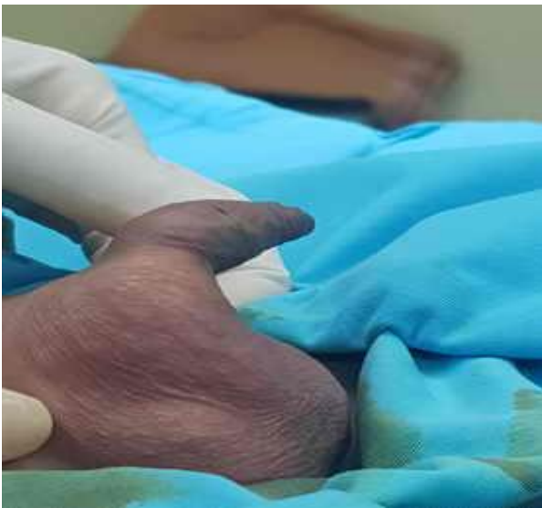
Fig. 1. Dorsal penile mass extending to the suprapubic and scrotum region.

computed tomography (CT) scan that shows solid tumor at the dorsal penis and suprapubic region. An ultrasound of the mass revealed a heterogeneous solid mass centered near on the dorsal aspect of the penile shaft. Further evaluation by CT study showed a heterogeneous density mass on the coronal plan CT image that erased the right muscle planes and reached into the pelvis and pushed into the bladder (Fig. 2).