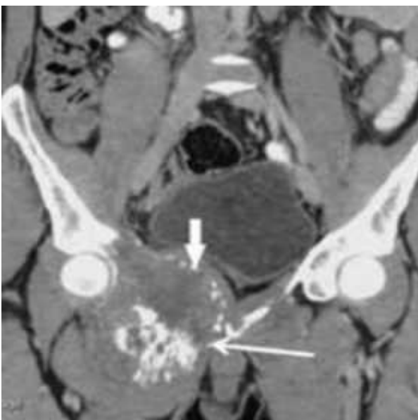
Fig. 2. Coronal plan CT image of the mass with heterogeneous density.

Incomplete surgical excisions were performed, macroscopically the sample was measured 3.2 cm x 4 cm x 3 cm and we also performed dorsal circumcision (Fig. 3).