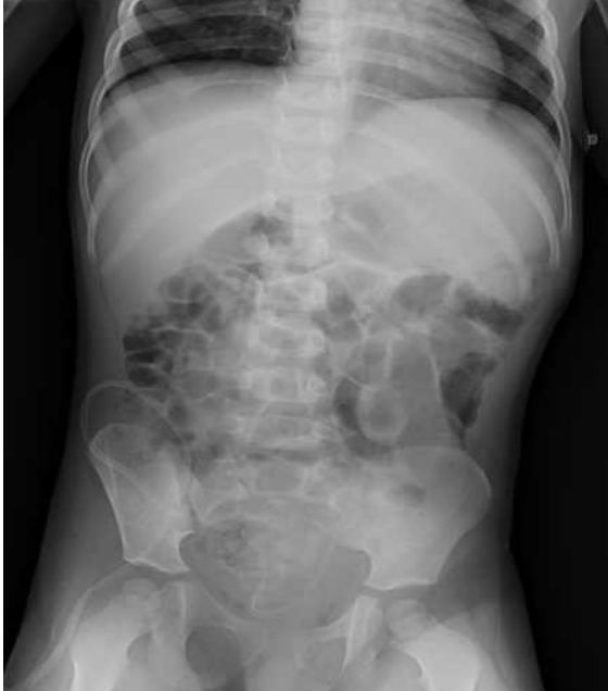
Fig. 4. Plain abdominal radiograph taken after surgery.

surgery [Fig. 4]. The patient is undergoing regular clinical, radiological, and laboratory follow-up for six months, and his general health status is good.