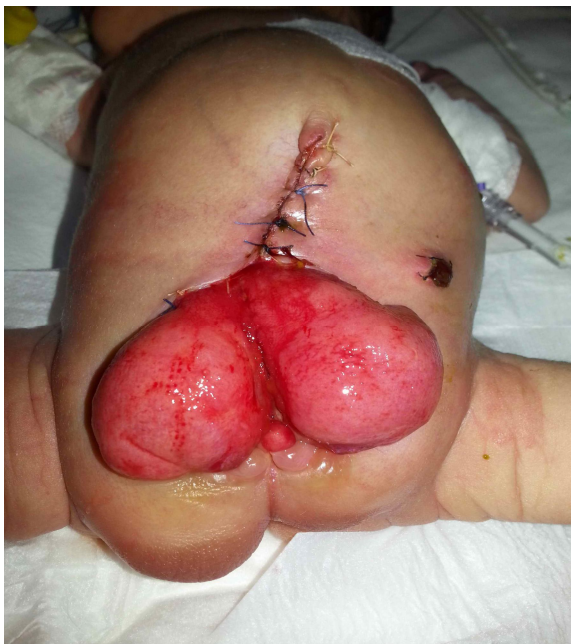
Fig. 3. The postoperative photo showing the repaired abdominal wall defect, the classic bladder exstrophy created by approximating of the bladder halves in midline, and end colostomy.

urogenital reconstruction along with pelvic osteotomy at least 3–6 months later. The rectus sheaths on both sides in the upper part of abdominal wall defect were approximated with difficulty by figure of eight stitches and the skin was closed. Thus the appearance of classic bladder exstrophy has become, but it was protruding due to increased intra-abdominal pressure (Fig. 3).