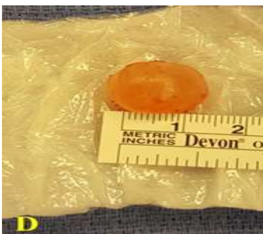
Fig. 2. A) Left testis with tunica albuginea opened and everted demonstrating densely

adherent epididymis. B) Sharp dissection through testicular parenchyma exposes the SIC. C) Isolation of SIC from left testicular parenchyma reveals no communication with tunica albuginea. D) SIC after enucleation.