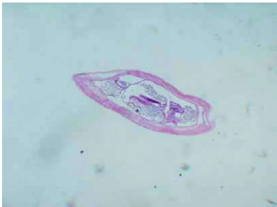
Fig. 2. Morphological features of Dirofilaria : a thick cuticle with longitudinal ridges, large lateral chords, slender coelomian muscle layer, a gut tube and spermatocytes in the genital tubule (H&E, 10x).

and spermatocytes in the genital tubule [Fig. 2].