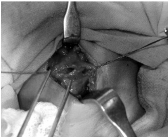
Fig. 2. Intraoperative photograph showing two large side-by-side perforations on the posterior aspect of bladder dome.

Closure of perforation was done in two layers. Supra-pubic catheter was placed and thorough peritoneal wash was given. Histopathology of excised margin of bladder