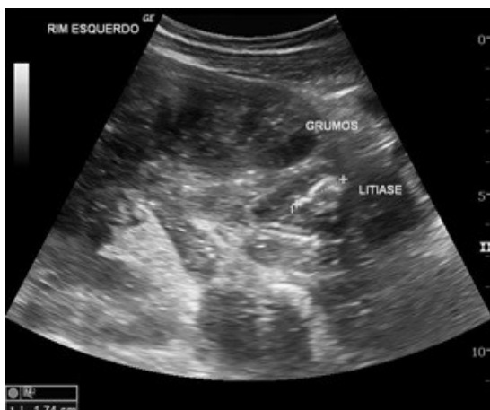
Fig. 2. Abdominal ultrasound – debris in collector system and hyperechogenic image with acoustic shadow - staghorn calculus measuring 1,74 cm.

Urine culture was positive ( Proteus mirabilis > 100.000 UFC/mL), and patient was treated again with pigtail insertion and antibiotics. Two weeks after hospital discharge, he returned to the emergency service with urinary tract infection symptoms. New ultrasound was performed and suggested pyonephrosis. CT scan was performed [Fig. 3].