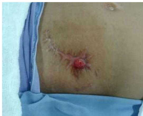
Fig. 4. Final abdominal aspect after urethrostomy surgery.

Due to the clinical conditions and great amount of pus inside the left kidney collector system, decision was taken to perform external drainage of the renal pelvis. Urethrostomy was performed and the patient had good clinical improvement [Fig. 4].