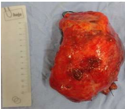
Fig. 5. Product of total left nephrectomy.

Histopathology confirmed XGPN diagnosis. The patient had good evolution after surgery and was discharged from hospital two weeks after the procedure. The patient remains in follow up with nephrologist and urologist, with good outcome at this time. One year after surgery, there has been no recurrent renal lithiasis or urinary tract infection.