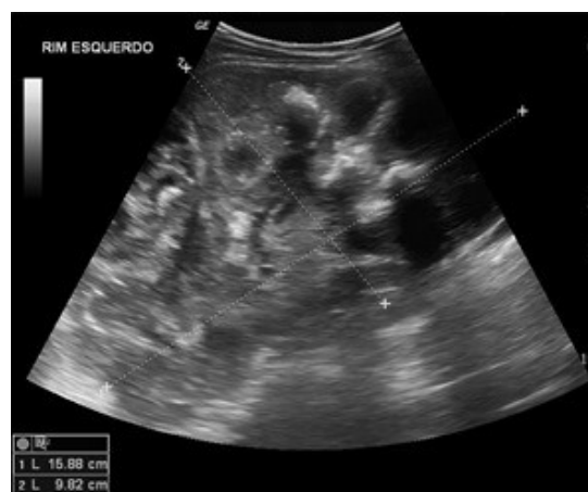
Fig. 1. Abdominal ultrasound – left kidney hydronephrosis, measuring 15,88 x 9,82cm.

In the first semester of 2014 he returned with fever and urinary symptoms, and workup showed calculi and hydronephrosis in left kidney again [Fig. 1,2], this time with renal lithiasis also on right kidney.