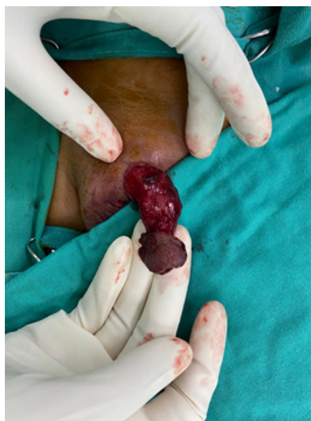
Fig. 1. Pre-operative findings show penile skin circumferentially degloved from its base up to the corona.

Intraoperatively, the penile corpora were uninjured and the penile skin circumferentially degloved from the base until the corona sulcus of glans (Fig 1). Glans penis and urethra were preserved. There is also a linear laceration wound over right scrotum measuring 1.5cm. Foley catheter size 10 was inserted to establish urinary outflow. The degloved skin edges was debrided and left with healthy viable skin. The skin over penis and scrotum was approximated with absorbable suture in interrupted manner (Fig 2 and 3). Dressing was done as per full thickness skin graft protocol.